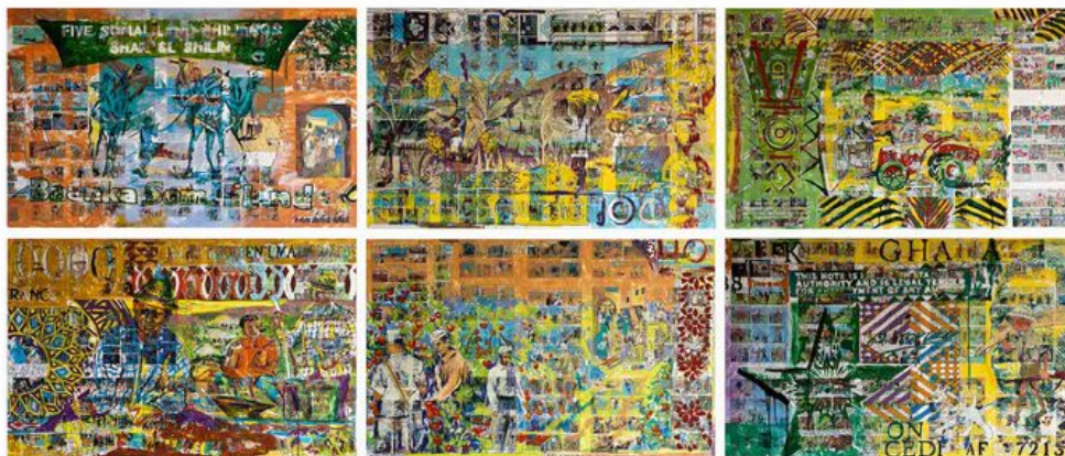
Pedro Alvarez, African Abstract , 2003, Oil on canvas, 146 x 348 cm (six panels)

The aim of the Havana installment, as Hernandez explains in the exhibition’s press release, is to show the other side of Cuban culture, “meaning Black tradition, the African inheritance.” That is, a legacy that arrived with slavery, leaving deposits of tradition and religion that are central to the Cuban cultural fabric today. This sentiment is traced in Hernandez’s curatorial choices—instead of exhibiting the works thematically, they are grouped hierarchically by the artists’ ages. Deceased and eldest are presented first, echoing Afro-Cuban religious practices during ceremonial rites. The works in Sin Máscaras , most of which were produced in the last three decades, include painting, photography, installation, and video by a number of well-known artists such as Roberto Salas and Carlos Garaicoa. The collection also includes work by less famous artists, favoring the amassed representations of a marginalized community over institutionally revered works.