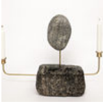
Amber Renaye Answers 5 Questions 14/01/19