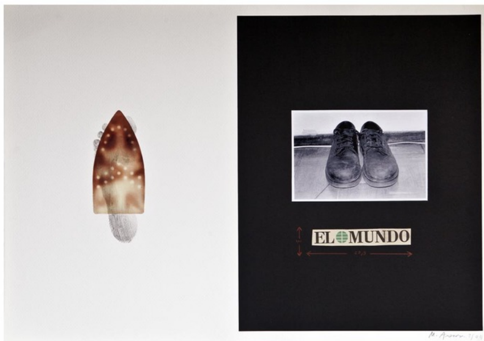
Manuel Arenas, El mundo , 2003, Collage, ash, and acrylic on card, 80 x 100 cm

Essential to the 1959 Revolution was forging the color-blind sentiment that Martí called for. Cubans came together to fight for the same cause, one that would affect all, rather than some fragments of the island’s population. For Cubans of color, however, it soon became evident that the temporary sense of unity failed; racism persisted after the revolution and to this day.